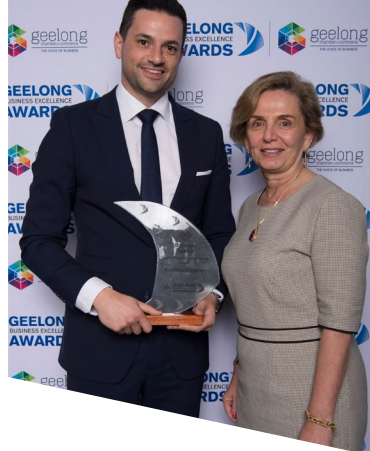
Cartland Property, Winner 2018 Health Promoting Workplace Award proudly sponsored by Barwon Health