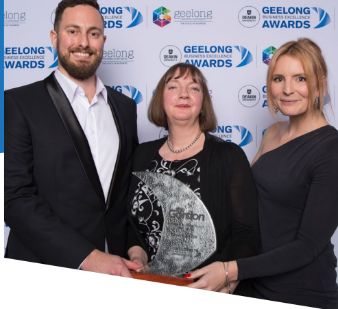
Sketch & Etch, Winner 2018 Emerging Business - Under 3 Years Award proudly sponsored by The Gordon