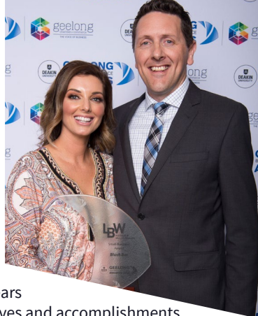
Blush Bar, Winner 2018 Small Business or Division/Department of a Business - 4 to 10 Employees Award proudly sponsored by LBW Business + Wealth Advisors

NOTE: Do NOT state actual results in $'s, use percentage (%) terms