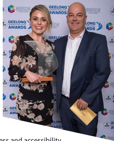
Grace Acting Studios, Winner 2018 Customer Service Award proudly sponsored by Westpac