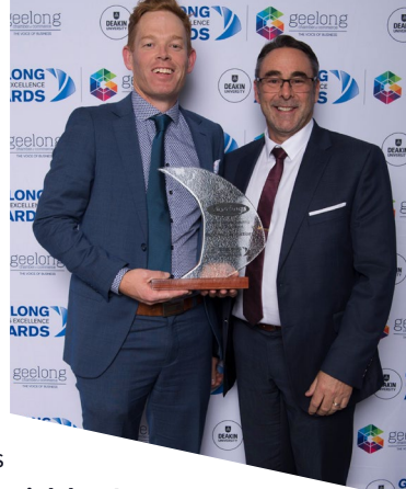
Reading Constructions - Winner 2018 Advanced Manufacturing & Industry Award proudly sponsored by Hardings

Do NOT state actual results in $'s, use percentage (%) terms